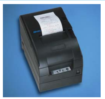
Conceal the Power Supply in the Optional Power Supply Cover