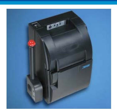
Built-In Wall Mount Capability and Optional Audio/Visual Print Messenger