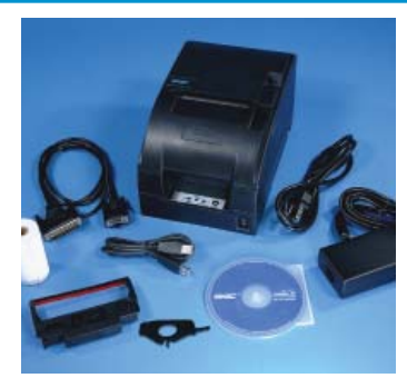
Includes Everything Necessary in the Carton